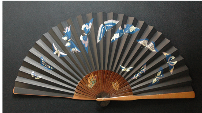
(Ishizumi Kamisaka Sekka Butterfly Fan)

You are cordially invited to enjoy the opportunity to view